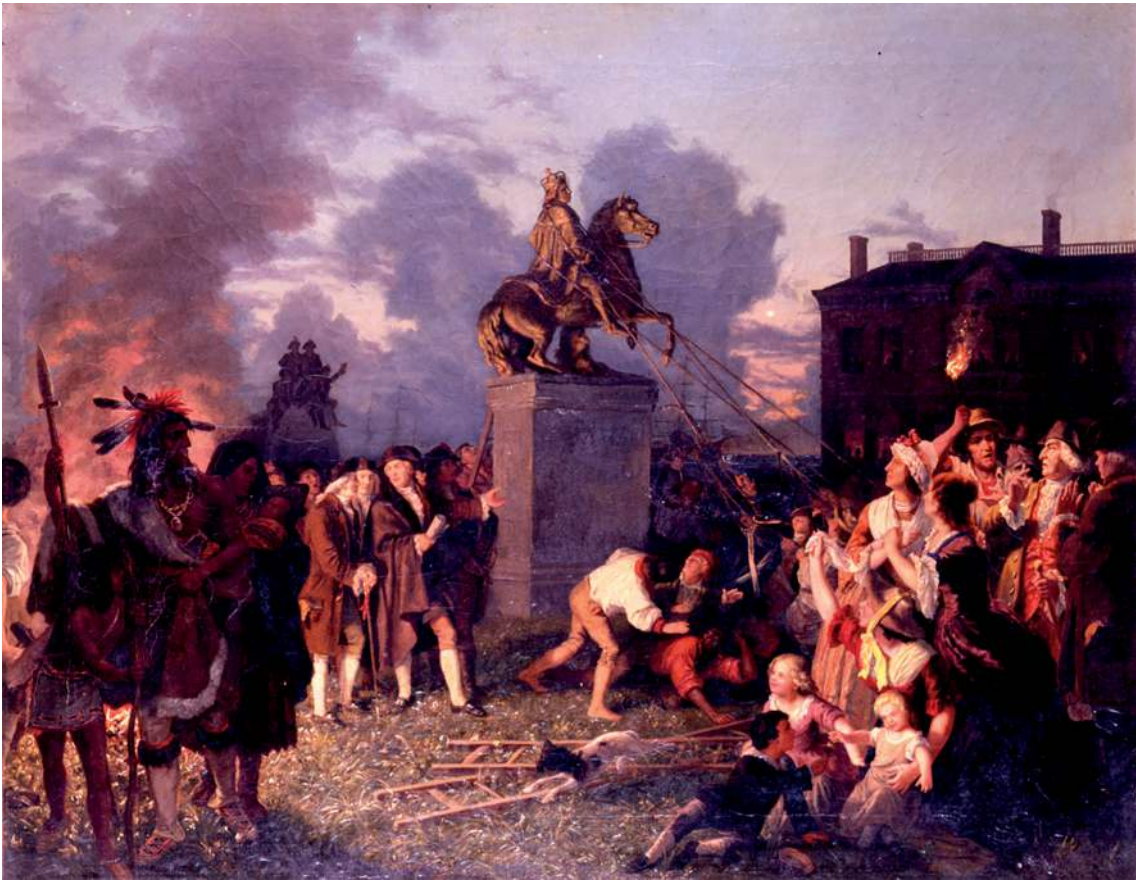
A painting showing the reactions of people in New York after the Declaration of Independence had been read out publicly, July 1776. The statue is of King George III.